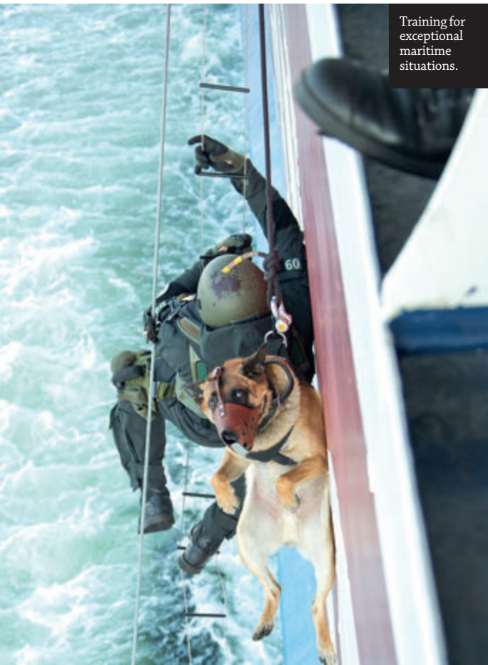
Training for exceptional maritime situations.