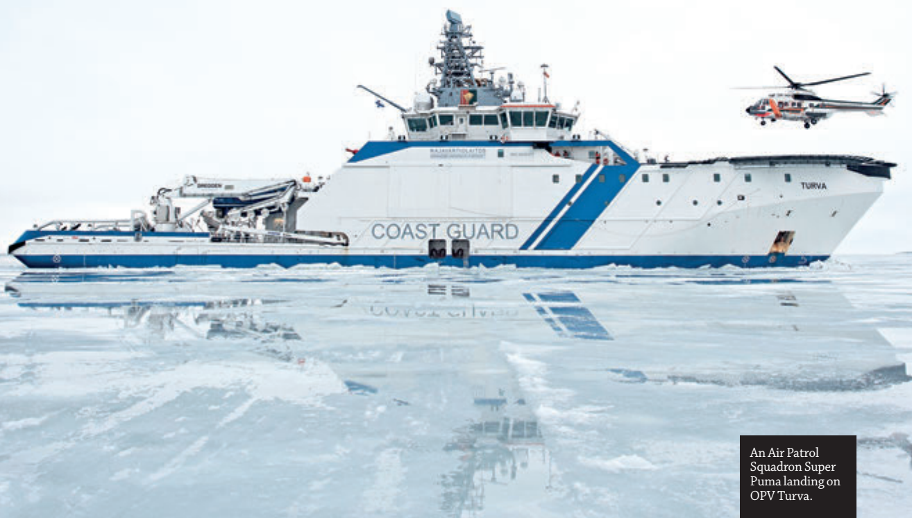
An Air Patrol Squadron Super Puma landing on OPV Turva.